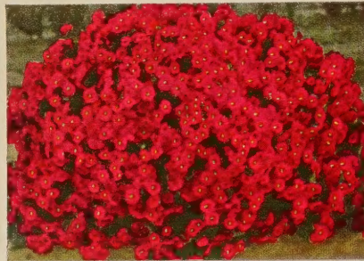
Red Cushion Mum

MIXED COLORS. 12 for $2.75; 25 for $5.00; 50 for $9.00; 100 for $17.00.